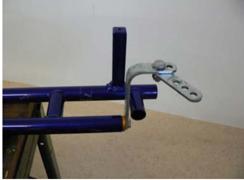
Photo from above of the frame with the section of the two supports for the exhaust system