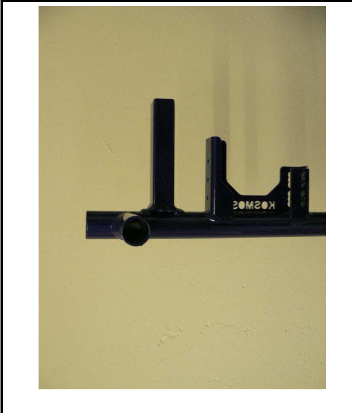
Photo of the frame from the side with the section of the support for the RTPS (Rear Tire Protection System)