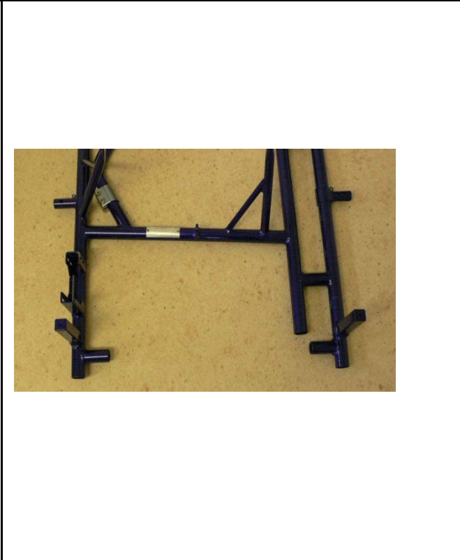
Photo from above of the frame with the section of the two supports for the RTPS (Rear Tire Protection System)