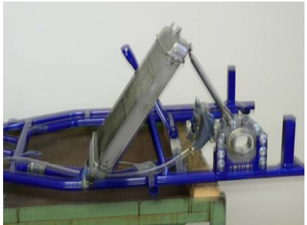
Photo of the frame from the side with the section of the supports for the radiator (radiator mounted)