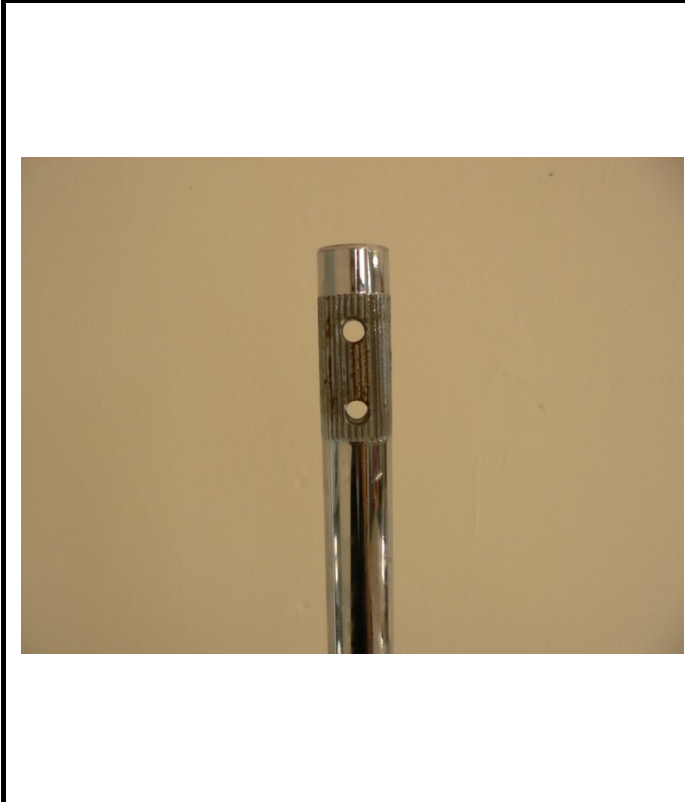
Photo from the steering column with the section with the knurling for the steering wheel hub (knurling according to DIN 82 - RAA1).