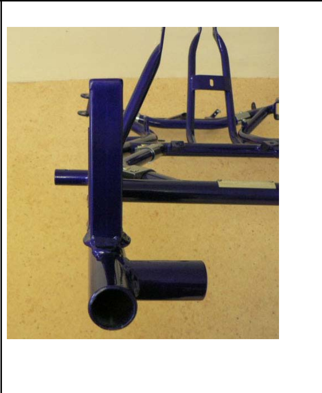
Photo of the frame from the back with the section of the support for the RTPS (Rear Tire Protection System)