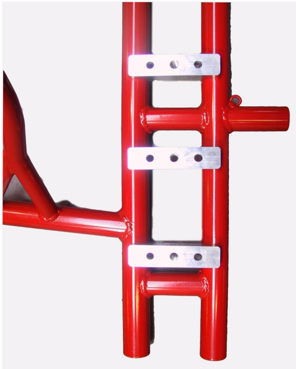
Foto from above of the frame with the section of the engine mount