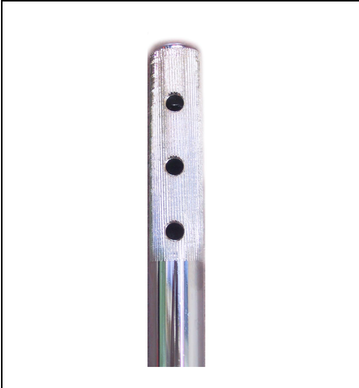
Foto from the steering column with the section with the knurling for the steering wheel hub (knurling according to DIN 82 - RAA1).