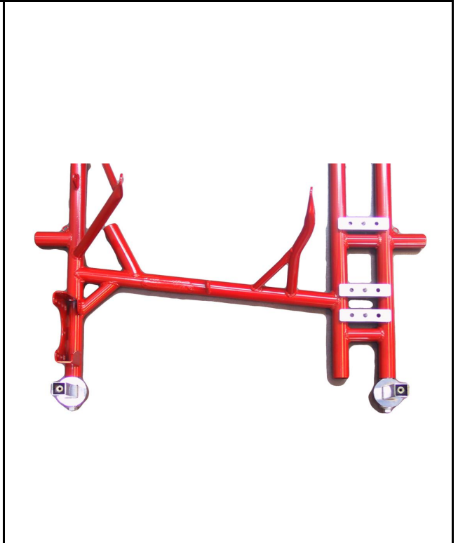
Foto from above of the frame with the section of the two supports for the RTPS (Rear Tire Protection System)