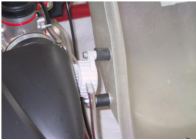
Foto of the frame with the section of the support for the fuel pump (fuel pump mounted)