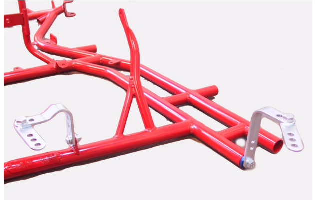
Foto from above of the frame with the section of the two supports for the exhaust system