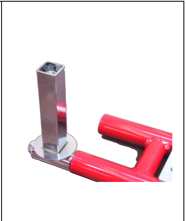
Foto of the frame from the back with the section of the support for the RTPS (Rear Tire Protection System)